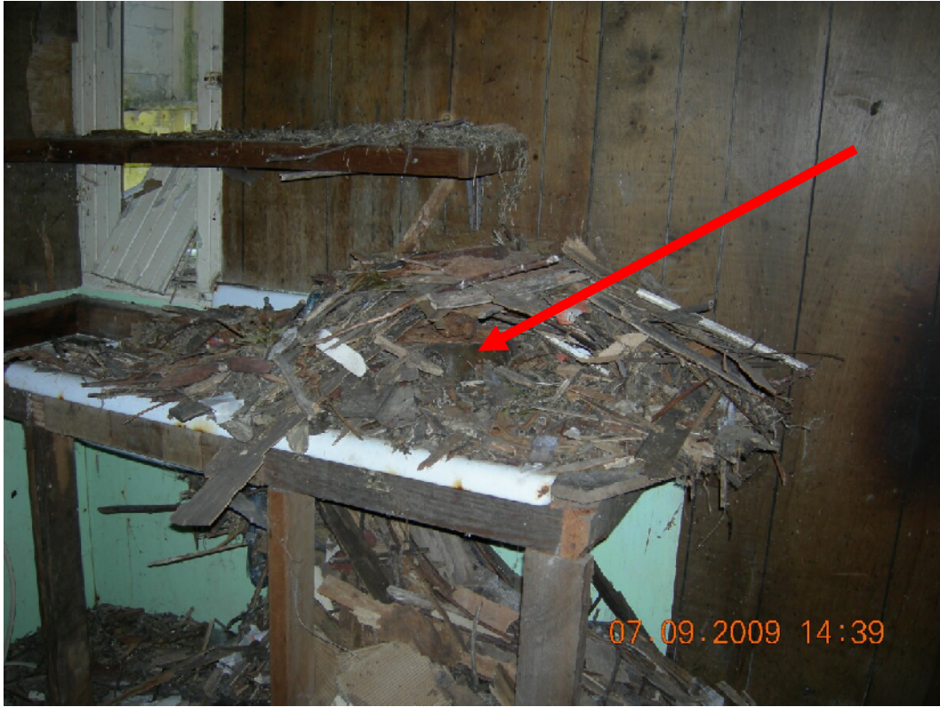
Figure 17. Example of debris in Cottage to be removed.