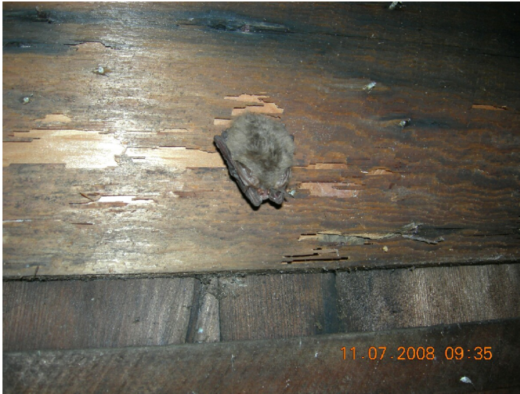
Figure 5. One of two C. townsendii in attic of Inn.