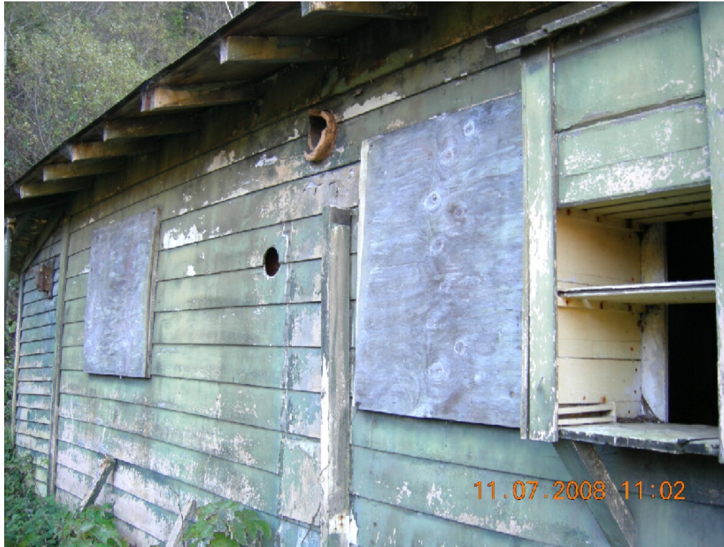
Figure 11. Openings into West cabin.