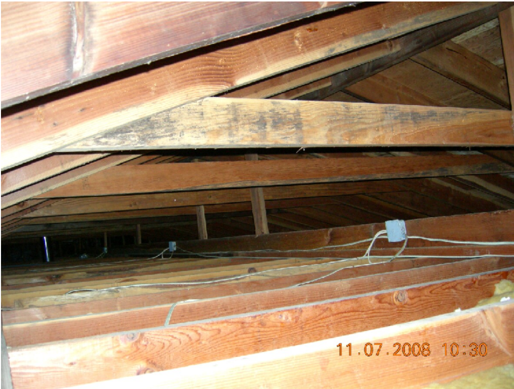
Figure 7. Motel building attic.