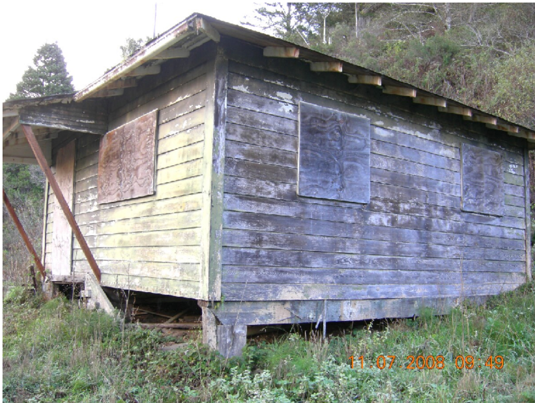
Figure 10. West cabin.