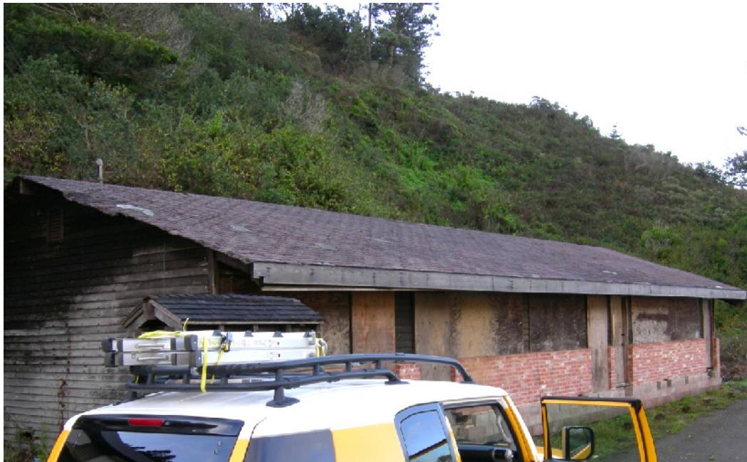
Figure 6. Motel building.