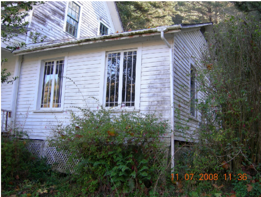
Figure 14. West wing of Mill House.