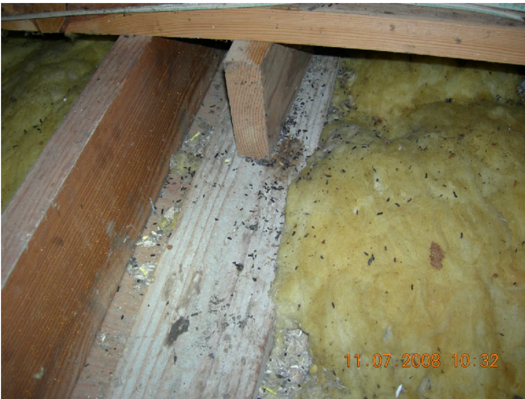
Figure 8. Bat fecals in Motel attic – probably Myotis sp.