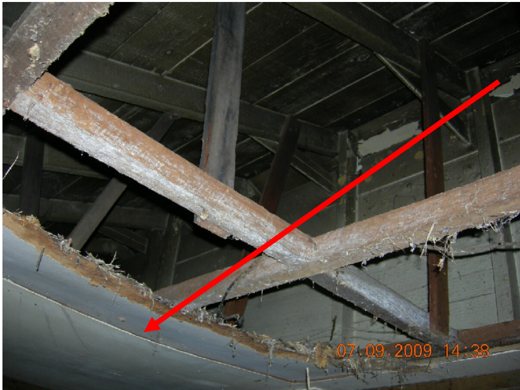
Figure 18. Remove decayed partial ceiling in Cottage, leaving rafters exposed.