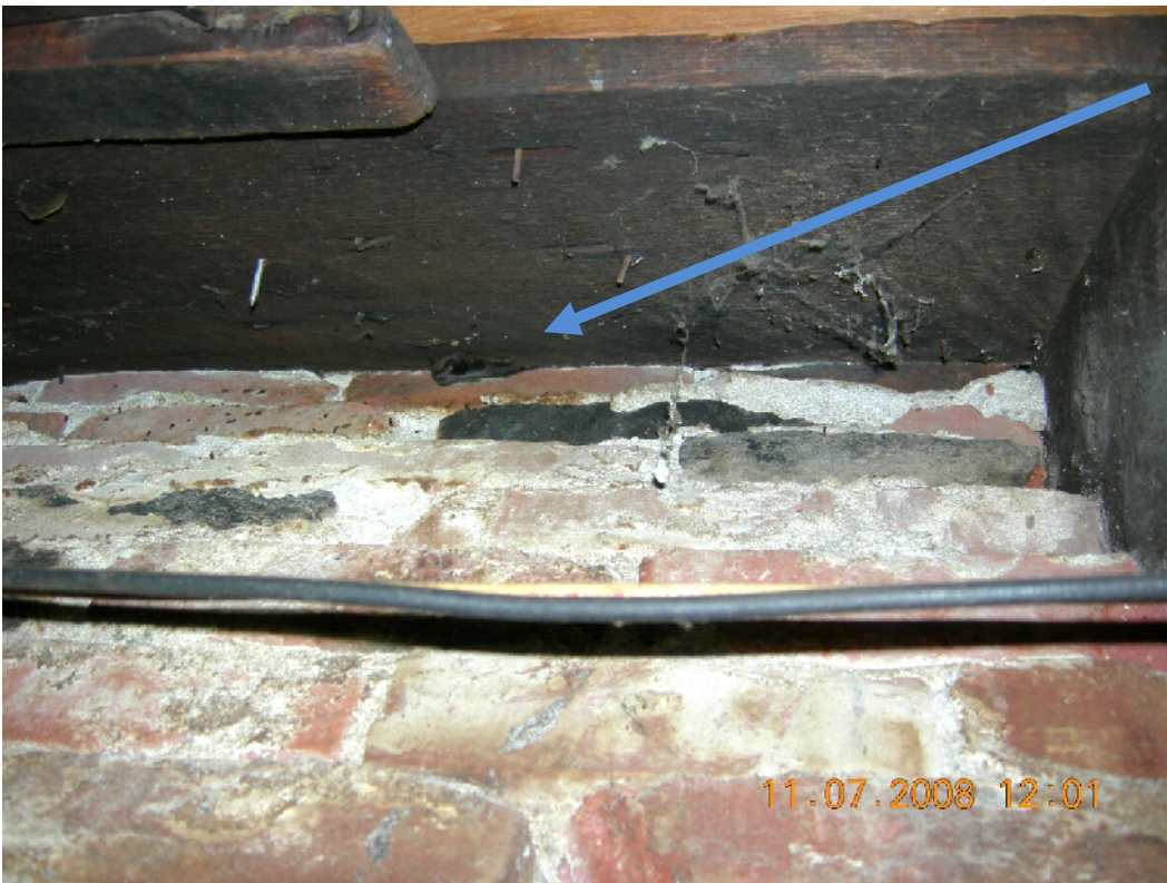
Figure 16. Myotis sp. in attic at chimney x roof corner.