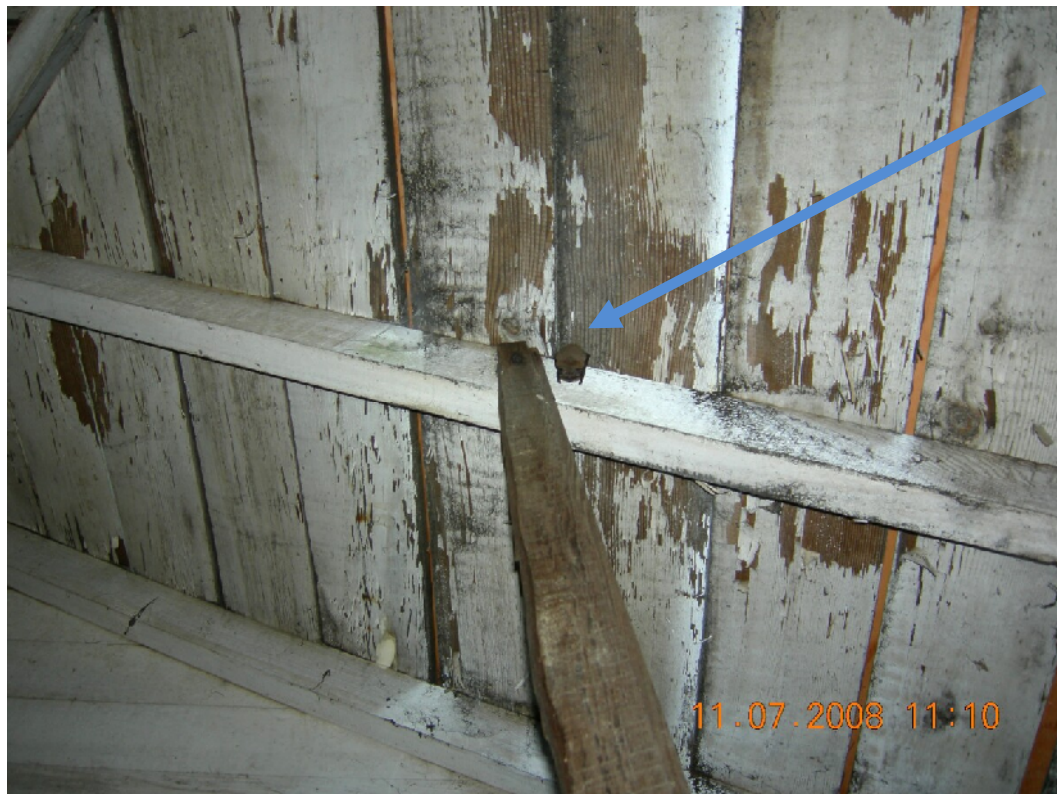
Figure 12. C. townsendii in West cabin.