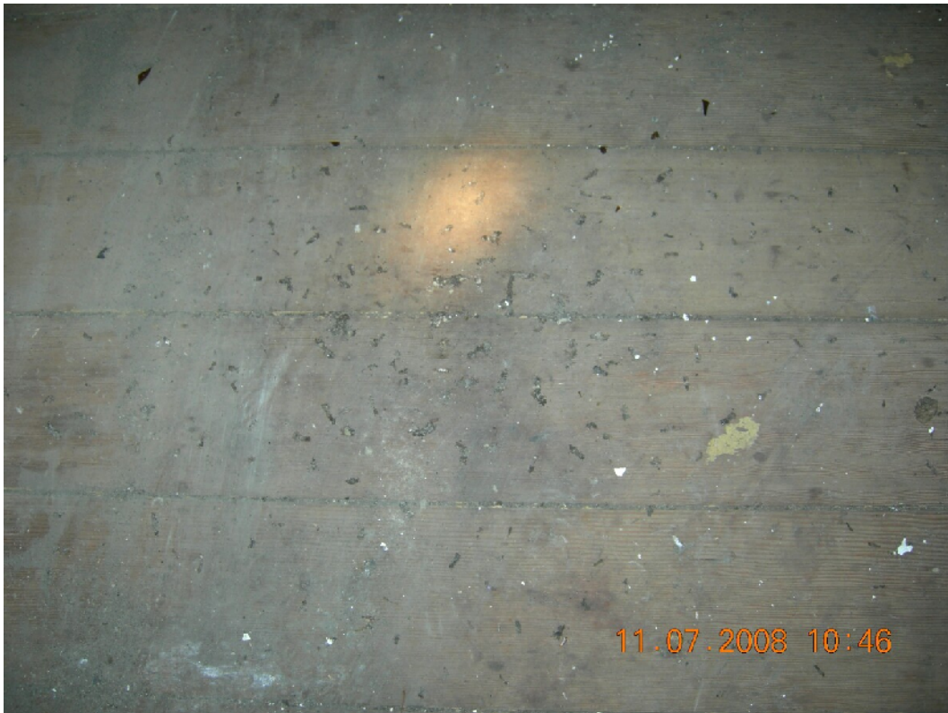
Figure 9. Bat fecals in Motel rooms – probably Myotis sp.