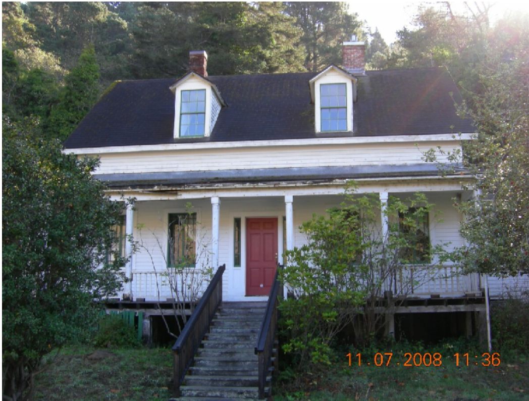
Figure 13. Mill House. Numerous openings available to bats at eaves, possibly dormers, vents.