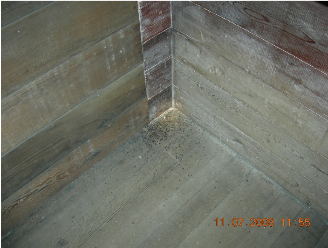
Figure 15. Bat fecals in Mill House upstairs closet – probably Myotis sp.