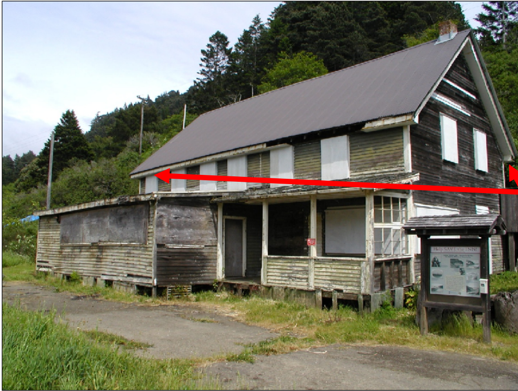
Fig. 1, Above. Red arrows show soffit boards, to be removed to increase light and airflow into structure prior to and throughout construction. Maintaining unsuitable environmental conditions for bat roosting activity will substitute for conventional blockage and humane eviction process in this case.