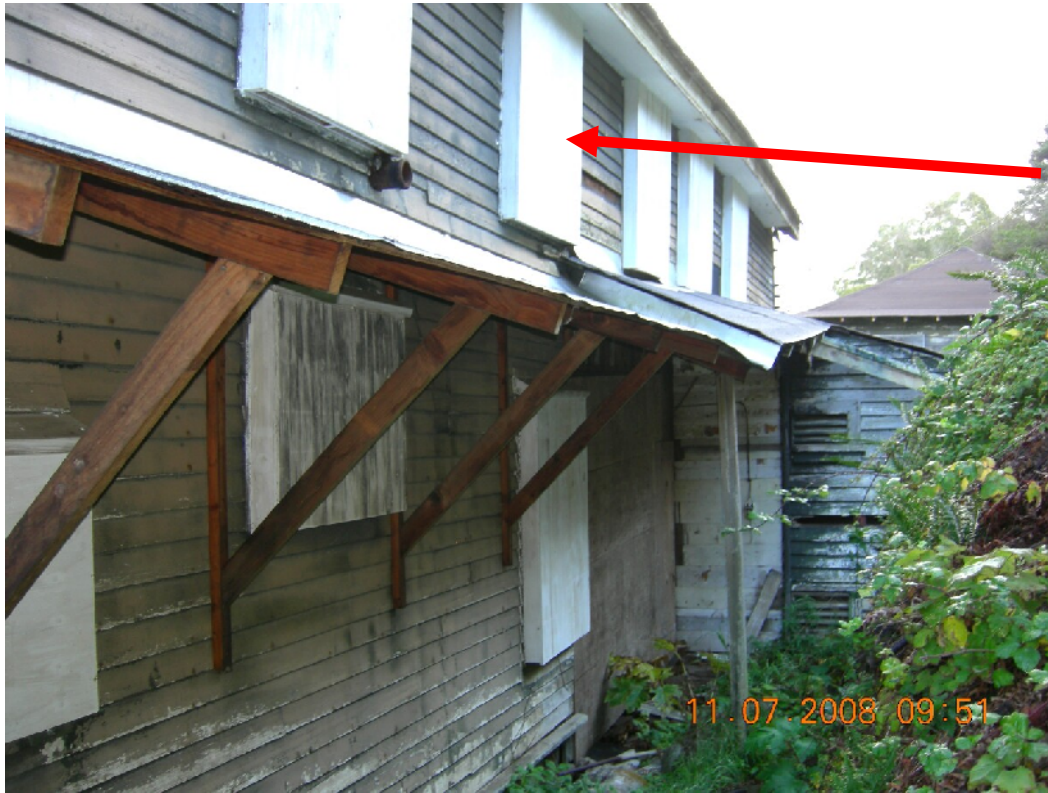
Figure 3. Rear of Inn, showing window covers, all of which are to be removed and windows left open before and throughout restoration.