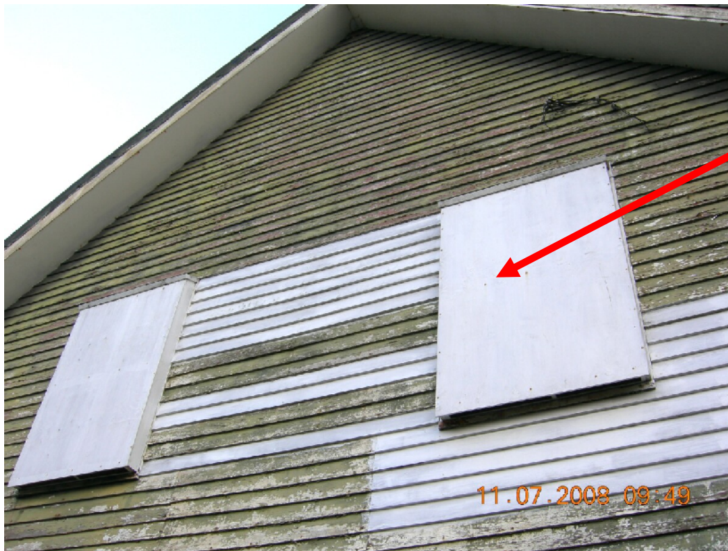
Figure 4. Remove window covers and open windows prior to and throughout construction.